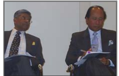
The Ambassadors of Indonesia (right) and Sri Lanka (left) at the Roundtable

The Washington Network for Post-Tsunami Peace Building Roundtable , co-sponsored by the Center for Peace Building International, a roundtable network group that allows NGOs and government agencies to meet on a monthly basis to discuss issues related to post-tsunami relief, reconstruction, and peacebuilding efforts in Sri Lanka and Indonesia. The first meeting was launched by the Ambassadors from Sri Lanka and Indonesia. Three months later this network has evolved into being a true inter-agency forum to explore the challenges and opportunities for reconstruction and peacebuilding. The US Special Envoy's Office (former US President Bill Clinton) has also joined the network.