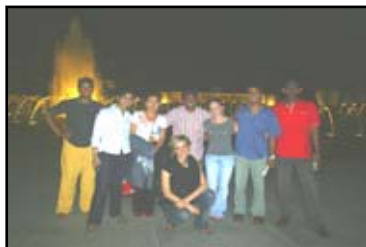
Participants taking a night tour of DC

This course focused on the ways we can accentuate the power of art to transform conflicts and enrich peacebuilding work, and how the arts can contribute to social justice, healing and dialogue.