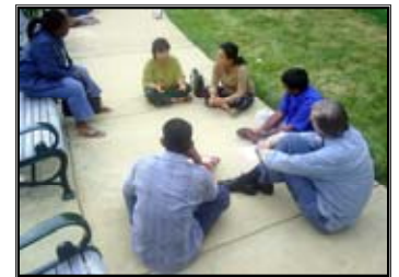
Children & Conflict Story Circle

The overwhelming majority of this year's Summer Institute participants called it a very satisfying experience. 3 Participants valued the content learned and the interaction with the professors in the course. 85% of the participants were very satisfied with the courses with 87% saying they would be interested in attending additional courses or workshops at American University.