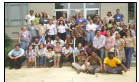
Week Three Participants

This course explored the relevance of peacebuilding as a framework for policymaking vis-à-vis the Islamic world.