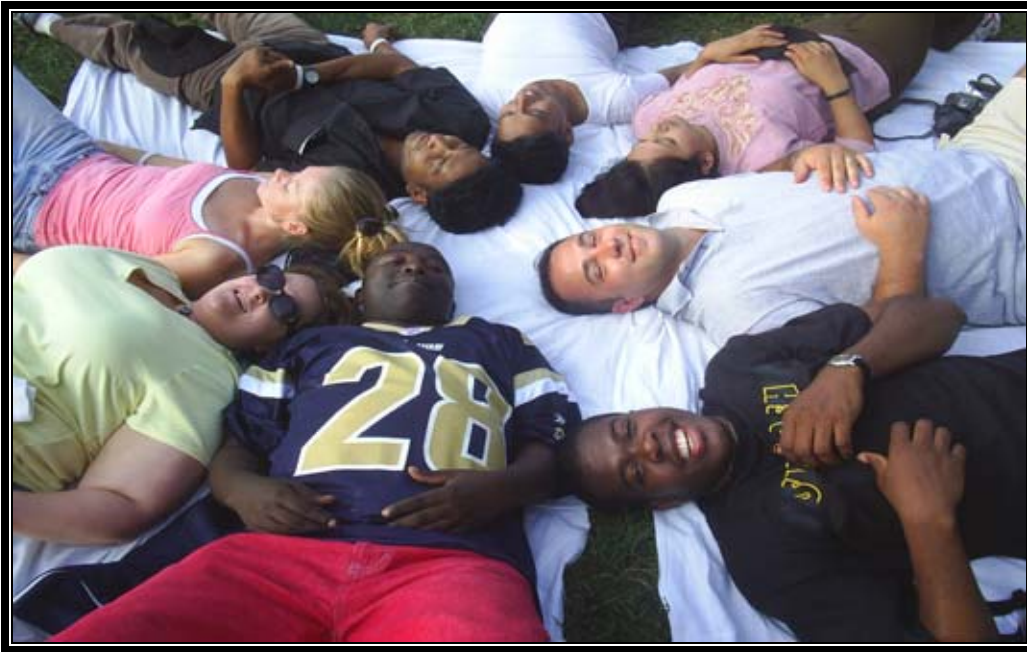
Taking a Break on the US Mall

Special Thanks: To the agencies that helped sponsor our participants such as AED, US State Department, USAID, and RTI International. We are also grateful to the many individuals and families in the DC area who hosted some of participants.