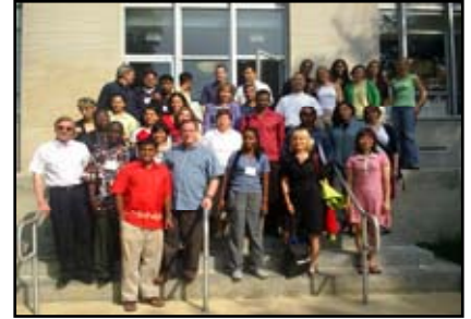
Some of the Week One Participants

This course was designed specifically for the individual and organization working in conflict-affected and structurally violent developing countries. It centered on operational considerations and approaches, strategy and goal development, program design methods and skills, and various types of analyses.