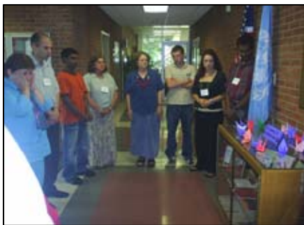
Tribute to the Children of Iraq