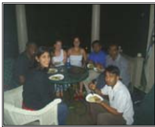
Dinner among Participants

This course addressed the various concepts on media and peacebuilding focusing on media assistance in conflict regions, mainly in short to medium term perspective.